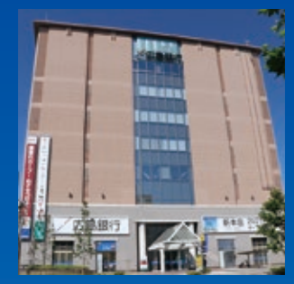
Hiroshima Bank Head Office (temporary Head Office)

Founded in November 1878, The Hiroshima Bank, Ltd. (the "Bank") is a regional financial institution headquartered in Hiroshima Prefecture, operating primarily in Hiroshima and the three neighboring prefectures of Okayama, Yamaguchi and Ehime. In addition to Branches and Offices in Japan, the Bank has representative offices in Shanghai, Bangkok and Singapore covering the entire area of East and Southeast Asia. Taking advantage of its extensive network, the Bank is providing comprehensive financial services including deposit taking, lending, money transfers, foreign currency exchange, and trustee services, along with investment trust sales and life insurance policies and other commercial banking activities.